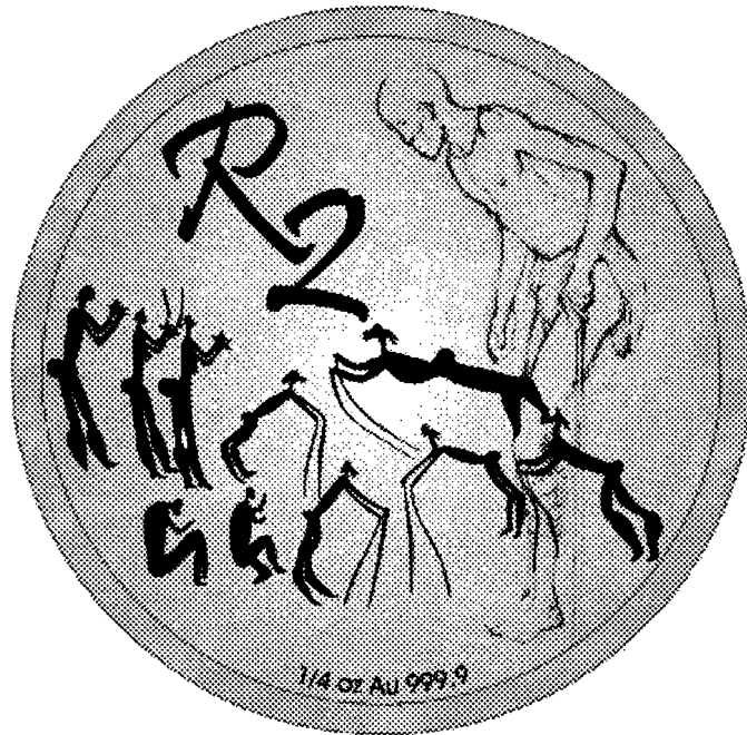
Reverse - R2 (1/4 oz) Gold Coin