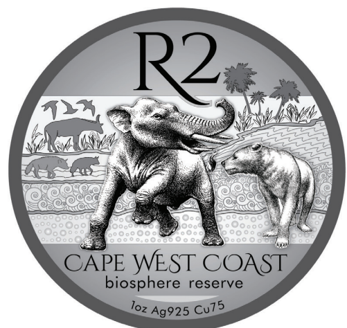
Reverse: R2 (1oz, Ag 925 Cu 75)