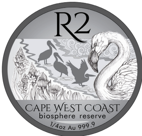
Reverse: R2 (1/4oz, Au 999.9)