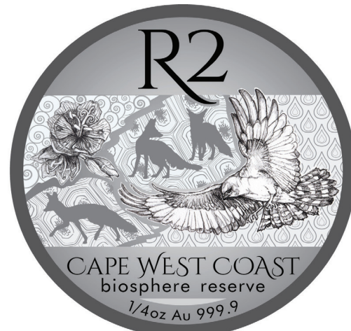
Reverse: R2 (1/4oz, Au 999.9)