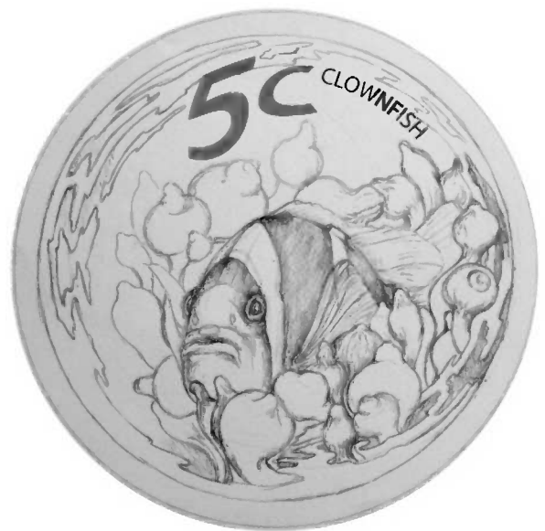
Reverse - 5c (1/4 oz) Sterling Silver Coin