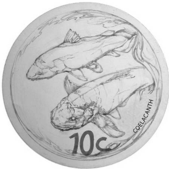
Reverse - 10c (1/2 oz) Sterling Silver Coin