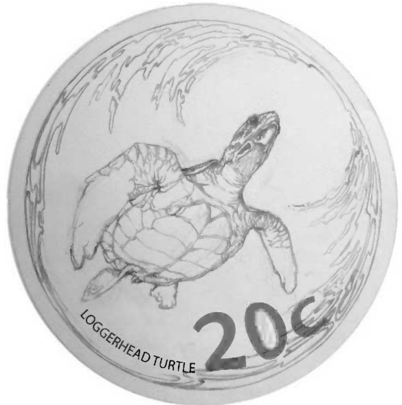
Reverse - 20c (1oz) Sterling Silver Coin