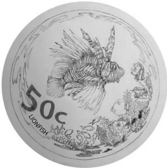
Reverse - 50c (2oz) Sterling Silver Coin